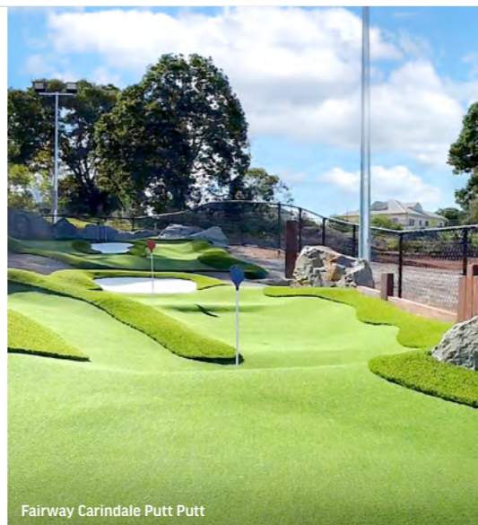
Fairway Carindale Putt Putt

Stay up-to-date with the latest progress by visiting the Fairway Carindale website.