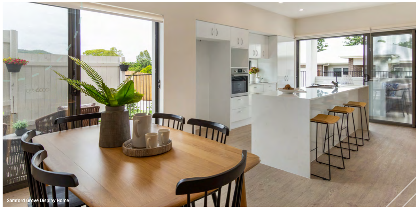
Samford Grove Display Home